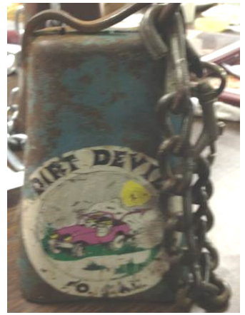
1 Old green cow bell.

Old Blue Mike Maneth Calico February 2012