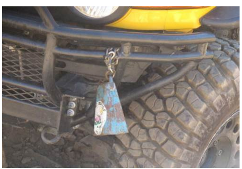
Proudly displaying the Cow Bell.